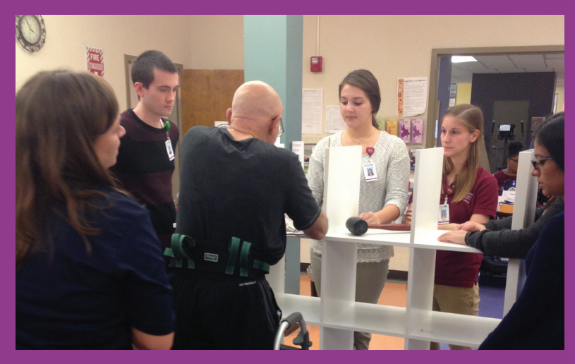
A client built shelves as part of an intervention for the Case Based Learning (CBL) course on Nov. 20. Each CBL group works with an individual for three sessions.