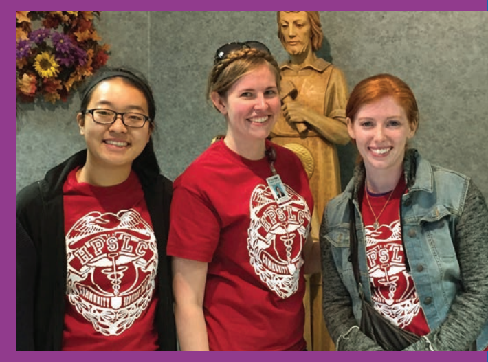
OT students in the Health Professional Student Leadership Council (HPSLC) volunteered at the Little Sisters of the Poor site as part of Community Service Day on Oct. 3.